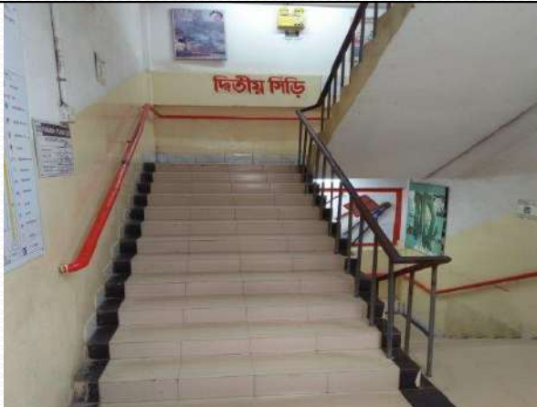
Secondary stair case of the factory