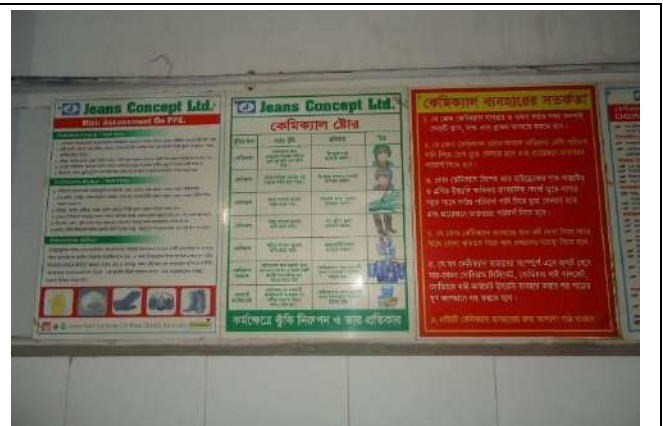
Awareness poster _ Chemical use