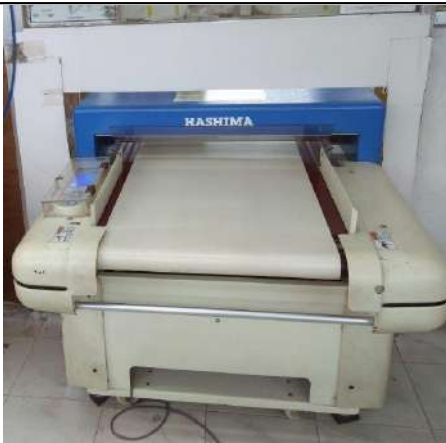
Metal detector machine