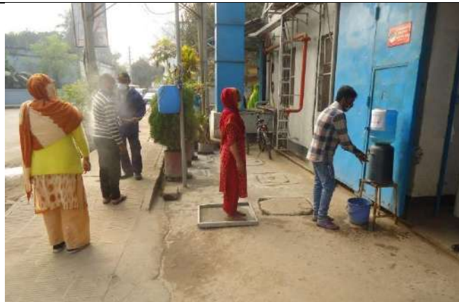
Covid 19 initiative _1