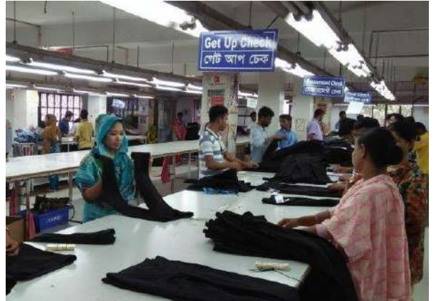
Finishing section (QC Check Area)