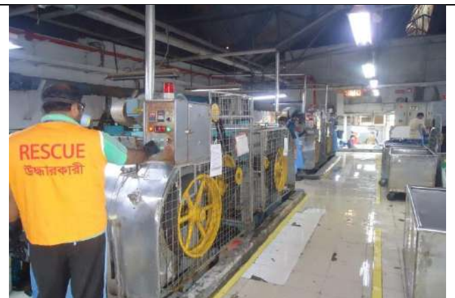
Wash section _ Pic 2