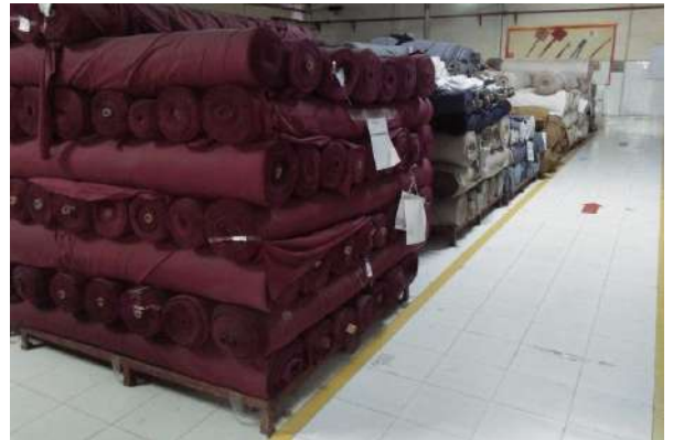
Fabric storage area