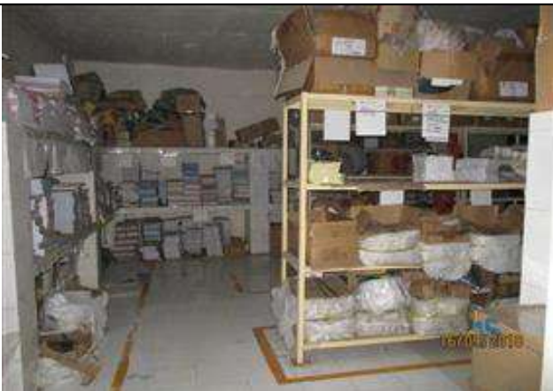
Accessories Store area