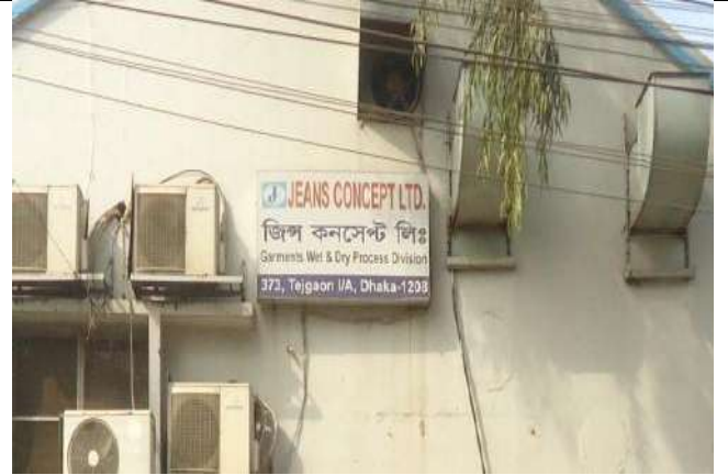
Front view of Jeans Concept Ltd.