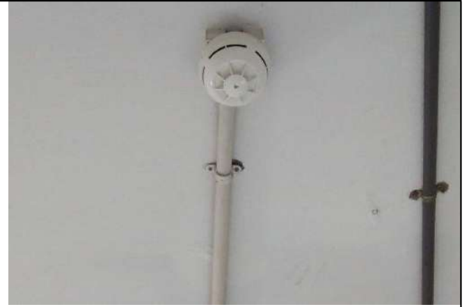
Central Detection & Protection System