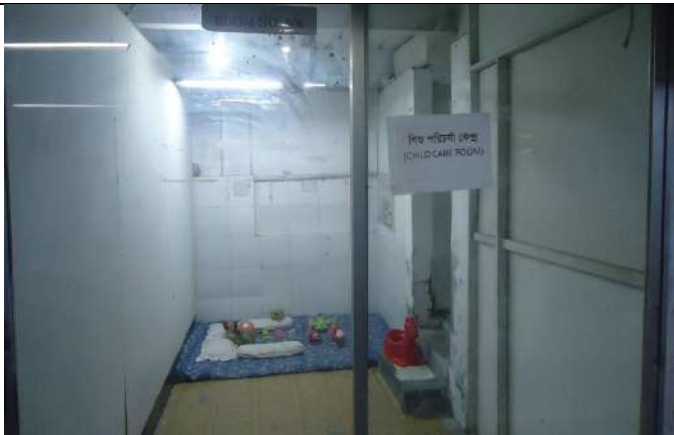
Child care room