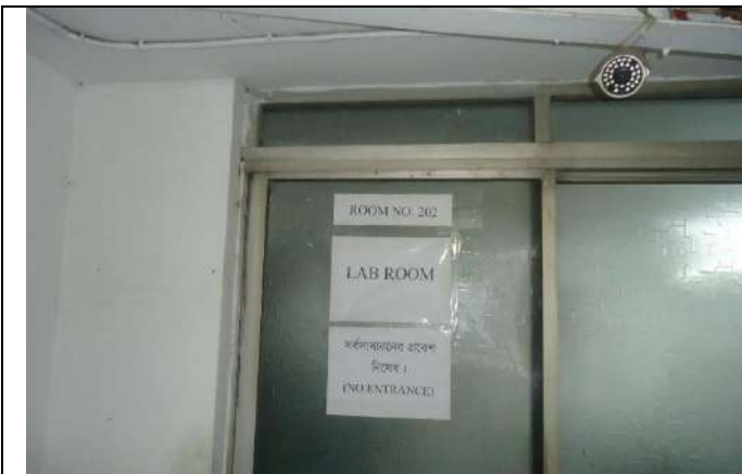
In house Lab