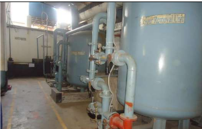
ETP _ Pic 1