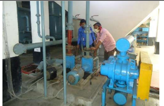
ETP _ Pic 4