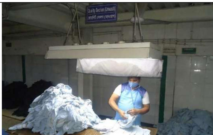
Section wise Quality checking system