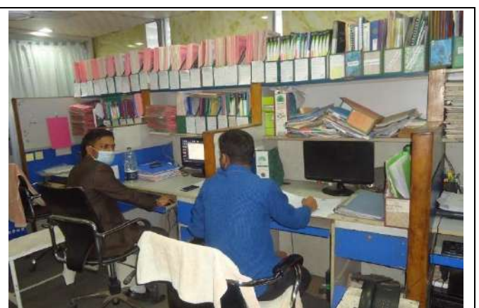
HR, Admin & Compliance Dept