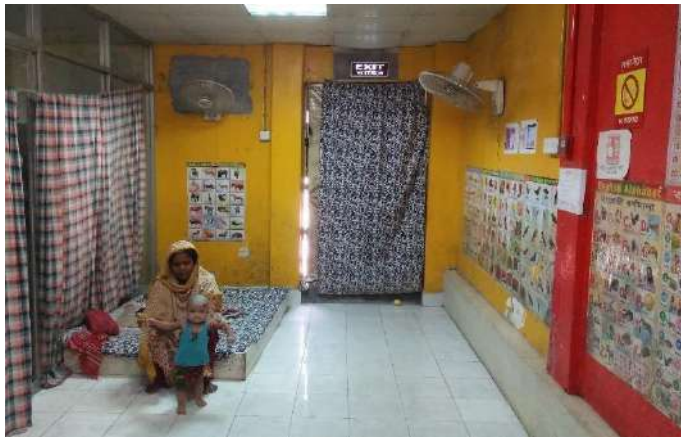
Day Care Room