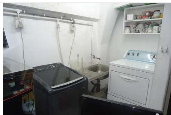
Inner view of Lab