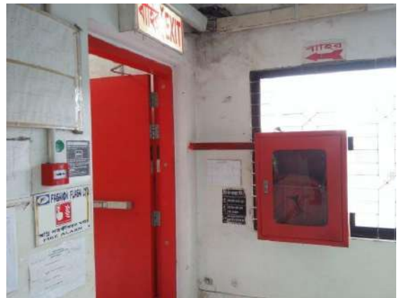
Fire resistant door