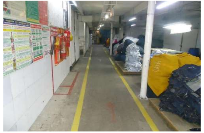
View of Unwash section _ 2