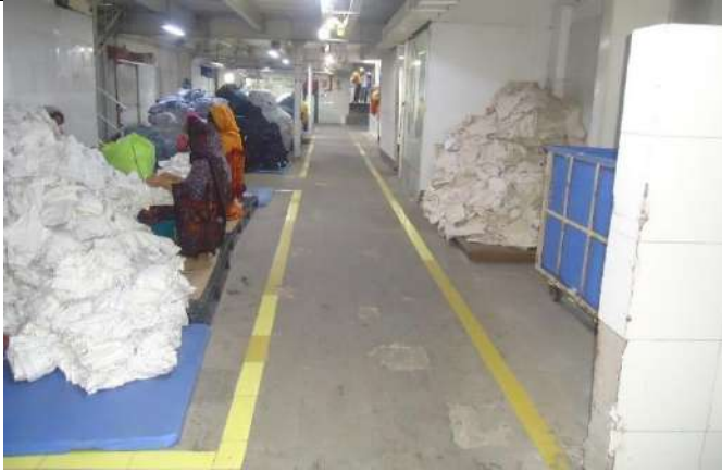
View of Unwash section _ 1