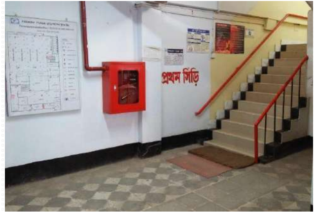
Main stair case of the factory