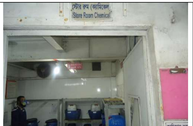
Chemical store _ Pic 1