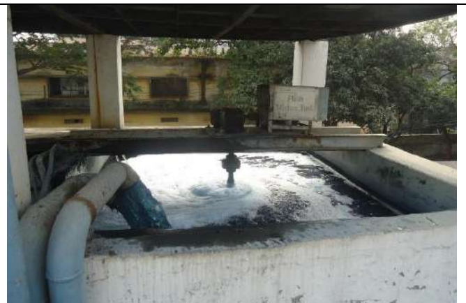
ETP _ Pic 2