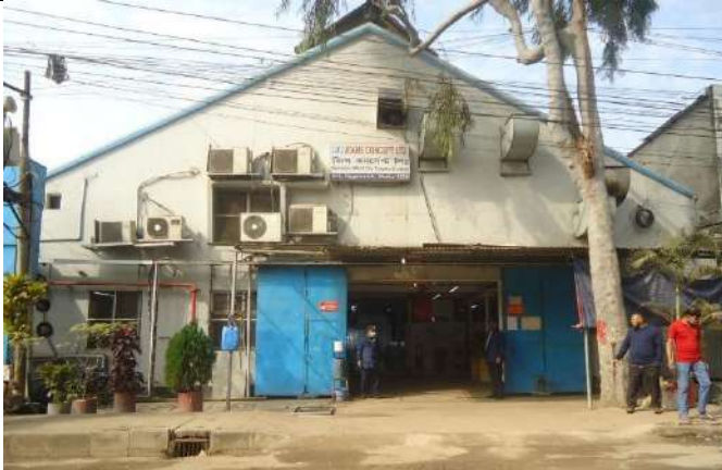
Front view of Jeans Concept Ltd.