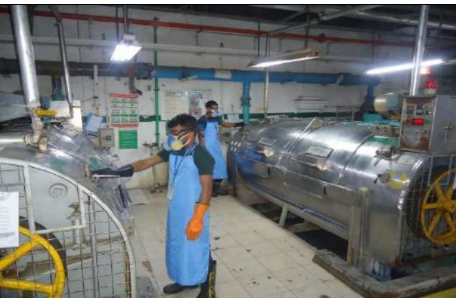
Wash section _ Pic 1