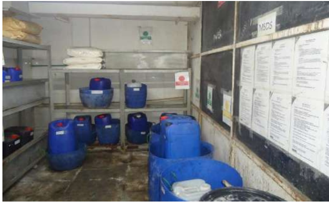
Chemical store _ Pic 2