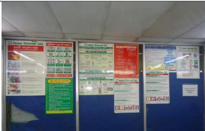
Awareness poster board _ 1