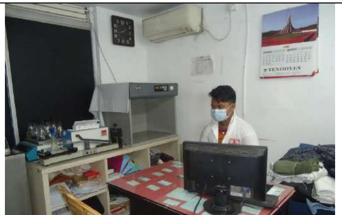
Inner view of Lab