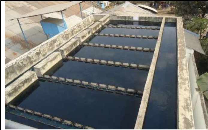
ETP _ Pic 3