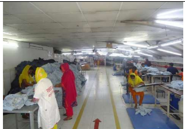
Dry process area