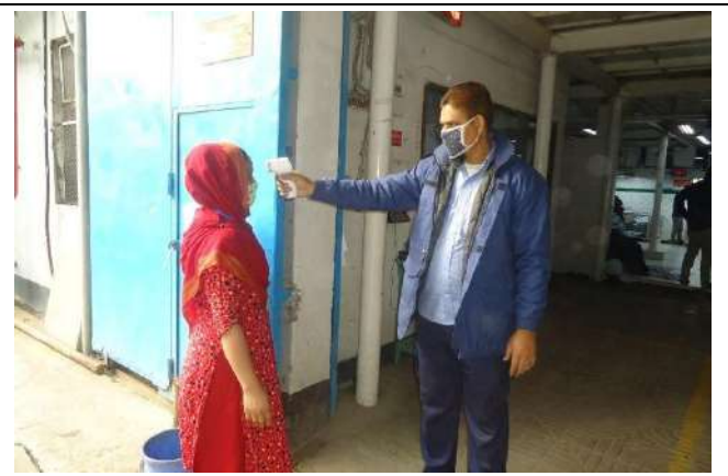
Covid 19 initiative _2