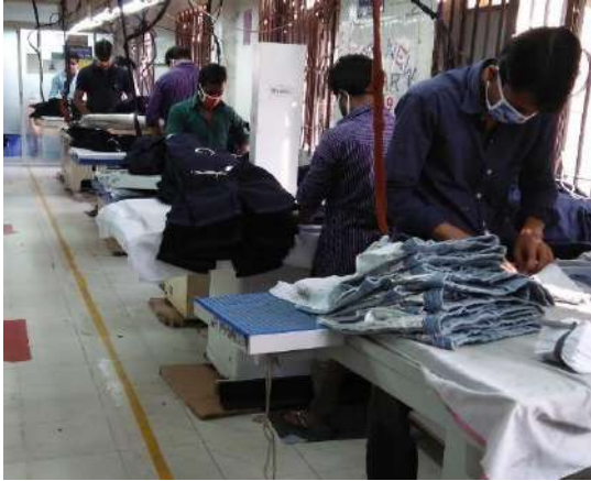
Finishing section (Iron Area)