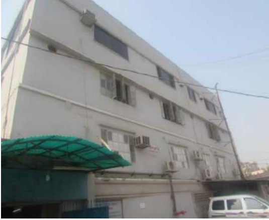
Front view of the factory building